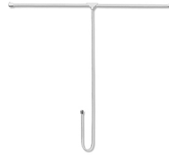
CCrane FM Reflect Antenna

NPR Labs will provide updates to this field service bulletin as field information warrants.