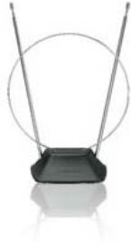
Radio Shack Budget TV Antenna Model